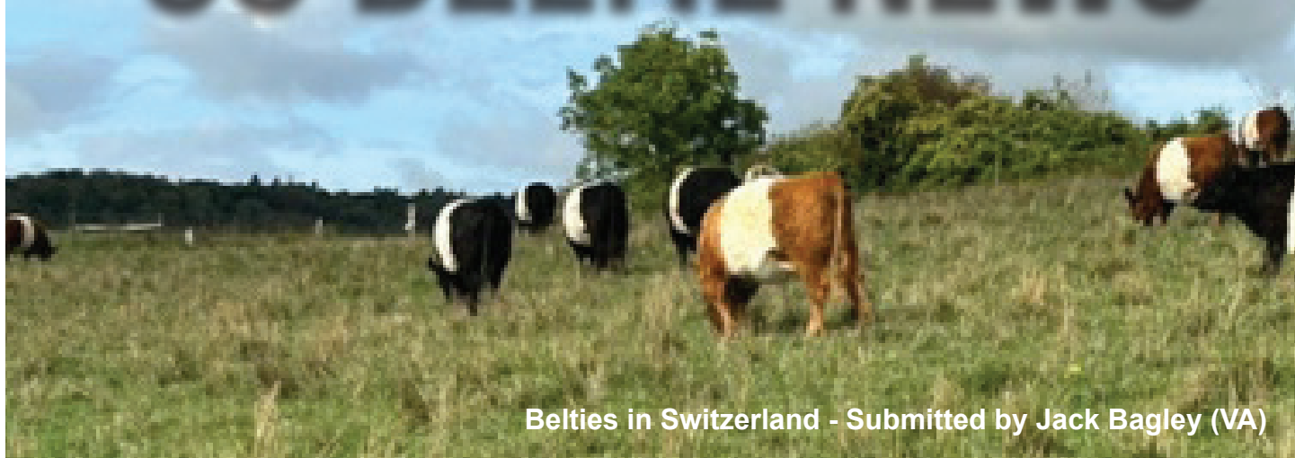
Belties in Switzerland - Submitted by Jack Bagley (VA)